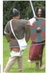
Grŵp ail-greu'r canol oesoedd, Gweryn y Gwyr.

Over 400 people attended an archaeological open day in July 2008 at Ammanford Castle, organised jointly by the Trust and Ammanford Archaeology and History Society, as part of National Archaeology Week. Other organisations and heritage groups participated, and, as well as displays and exhibitions, talks and tours were given. Demonstrations by an early medieval re-enactment group, Gweryn y Gwyr, proved very popular.