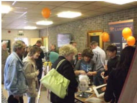
The exhibitions and stands proved very popular with visitors.