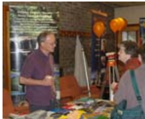
Roedd yr arddangosfeydd a'r stondinau'n boblogaidd iawn ymhlith ymwelwyr.